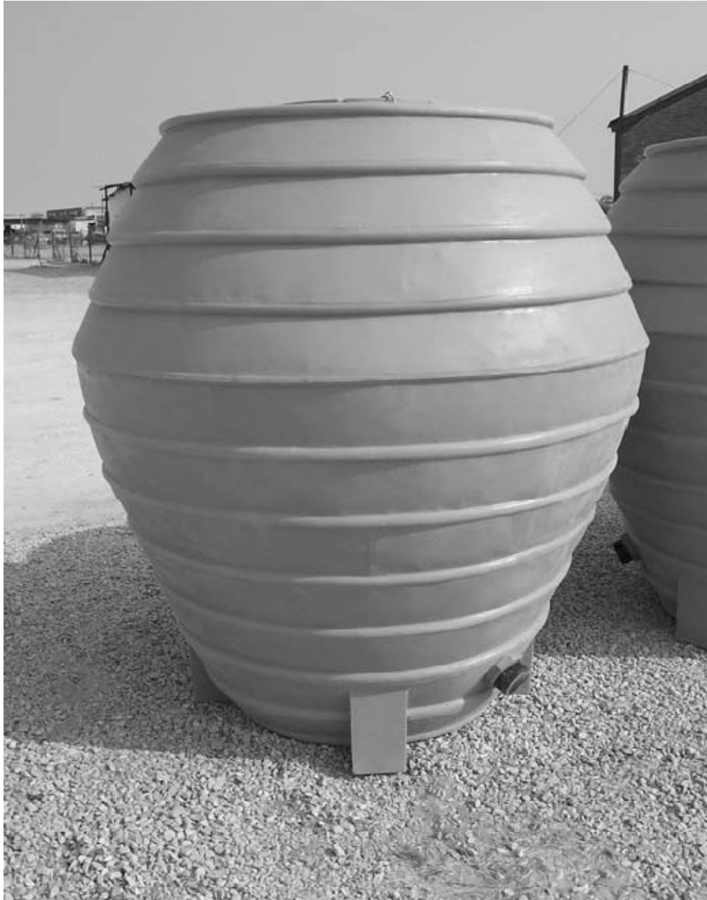
Figure 6.3.5 Plastic granary

Plastic drums (fig.6.3.5) of all sorts, including water tanks, can be sealed and used as effective hermetic grain store