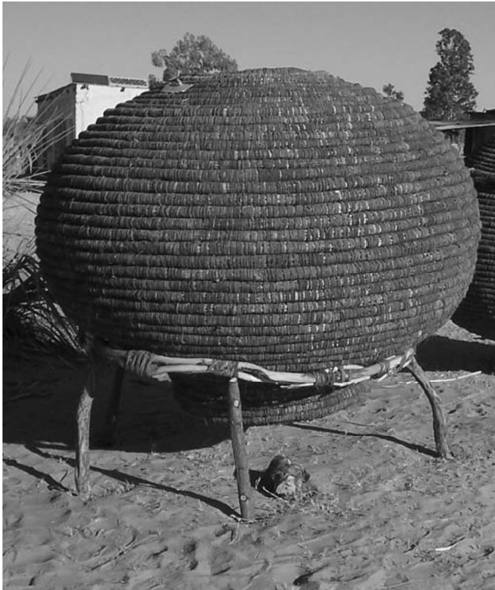
FIGURE 7.3.5 The traditional mopane wood model