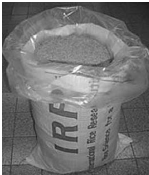
FIGURE 5.3.5. IRRI super bag (the gas- and moisture proof liner)

Bags and other storage structures (Figure 5.3.5) made of plastic have the advantage that they can be made airtight (hermetic). Under such conditions, bio-deterioration can be slowed. One such method currently under extensive promotion is the use of “triple bagging” for cowpea storage, although it could be adapted for grains. The triple-bagging technique was developed as an effective hermetic storage method in Cameroon using two inner bags made of 80 micron polyethylene and one outer, more durable bag to help protect against damage. Well-dried cowpea fills the first bag, which is tied shut securely using string. The first bag is placed within a second bag, and this is closed securely. A third bag is used to enclose the first two and to protect against damage. Clear plastic bags are recommended so that the cowpea can be inspected easily for any signs of insect attack. It is also recommended that the bags should remain sealed for at least two months after they are filled, and after they are opened, they should be resealed quickly to prevent entry of pests. The bags must be kept safe from rodents that might make holes in them and so break the seal.