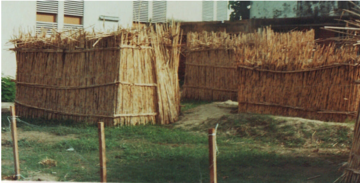
Figure.2.3.5 yam barn in guinea savanna

At the onset of the rainy season the yams are transferred to a mud hut or guinea corn storage rhombus to protect them from the rain. Another yam storage structure found in the savanna region is the yam house or yam crib. “Yam houses” have thatched roofs and wooden floors, and the walls are sometimes made simply out of bamboo. They are raised well off the ground with rat guards fitted to the pillars. Yam tubers are stacked carefully inside the crib (Figure 3). Yam is also stored underground in trench or clamp silos. In both methods a pit is excavated and lined with straw or similar material. The tubers are then stored on the layer of straw either horizontally on top of each other or with the tip vertically downwards beside each other. The yams are then covered with straw or similar materials; in some cases a layer of earth is also added.