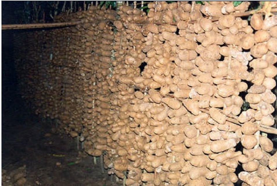
Figure 1.3.5 Typical yam barn in the humid forest zone of Nigeria (individual yams tied to live poles)

The yam barn in the Guinea Savannah zone is constructed from guinea corn stalk, sticks, grass and yam vines (fig.2). The yams are heaped at different positions in the barn. Such barns are constructed every year and are situated near the house under a tree to protect the tuber from excessive heat. At the end of the storage period the barn is burnt down and in December/January a new structure is built for the next harvest. Unlike the humid forest where it is important that the yams are separated to avoid rotting, in drier areas such as Niger State the yams can be stacked into piles in the barn.