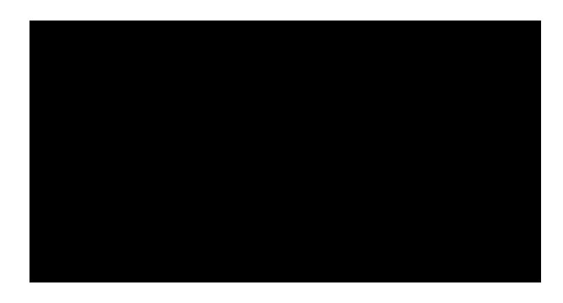
Fig. 10.1: Regional Distribution of the World Pig Population (FAO 1988)

The distribution of pigs throughout the world is not uniform. Nearly half the world's pig population is in Asia, with a further 30 percent in Europe and the USSR. In contrast, the population in large parts of the tropical and sub-tropical developing regions (e.g. Africa and Latin America) is relatively small (figure 10: 1). Nevertheless, the increase in the world pig population over the last decade is largely attributable to increase within the developing world, which now constitutes some 60 percent of the world population of pigs. It is noteworthy that the majority of the pigs in the developing world are located in one Asian country, namely China.