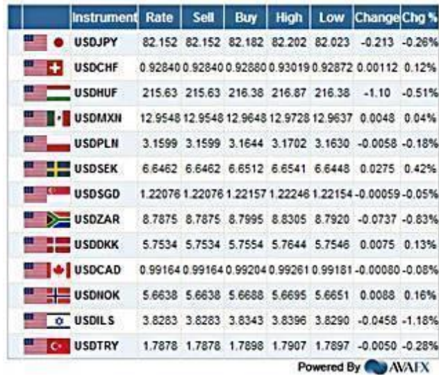
Table 1: US Foreign Exchange Rates