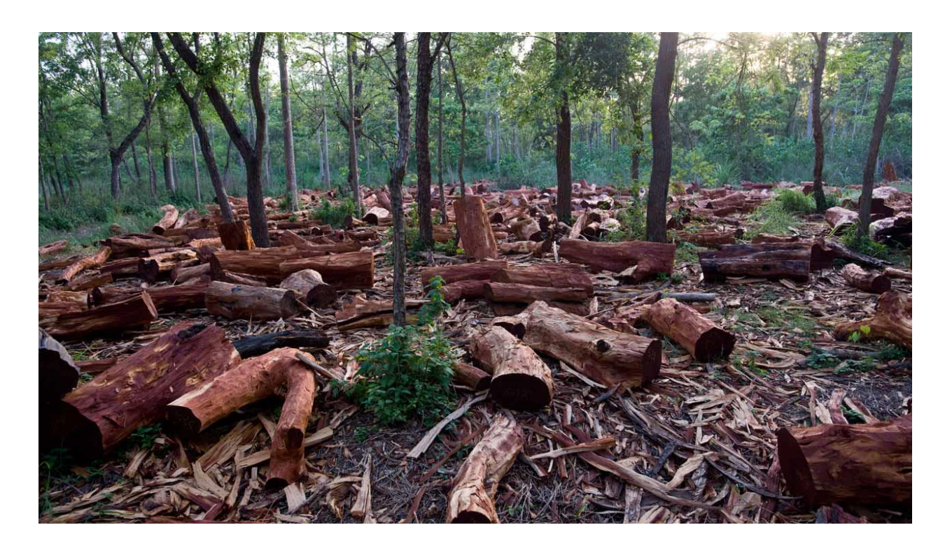
Example of deforestation

Humans will always depend on the Products from the forest for food, fuel, shelter and sustenance. However the activities of human on the forest areas should be limited for the sustainable forest areas.