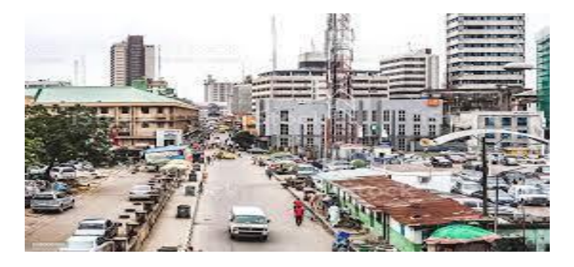
Lagos an example of an urban area in Nigeria, SOURCE: Istockphotos.com

Urbanization is the process by which large numbers of people become permanently concentrated in a particular area through the process of the movement from rural to urban areas, leading to a rise in the population and city dwellers. It is the growth of town and cities at the expense of the rural areas. In this instance as the cities increases the rural areas decreases in population. Taking a look at some of the existing positions on urbanization, McGranahan and Satterthwaite (2014) paper debunked some positions on urbanization, taking a current stand that "Africa is not the fastest urbanising continent (Asia is); the rate of urbanisation in low-income countries is not unprecedented or accelerating (indeed it has been falling for decades now); megacities are not becoming the predominant urban form (megacities, with populations over 10 million only account for 10 per cent of urban population and most are not growing particularly fast); and urbanisation is not the primary driver of urban land expansion"