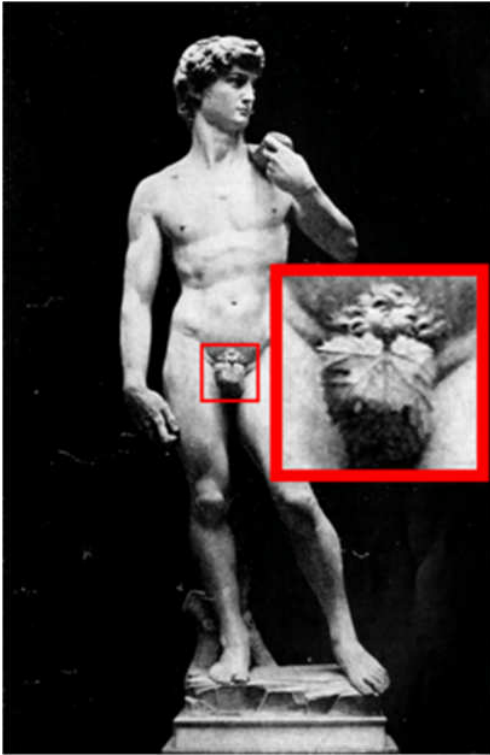
Michelangelo's David 1912