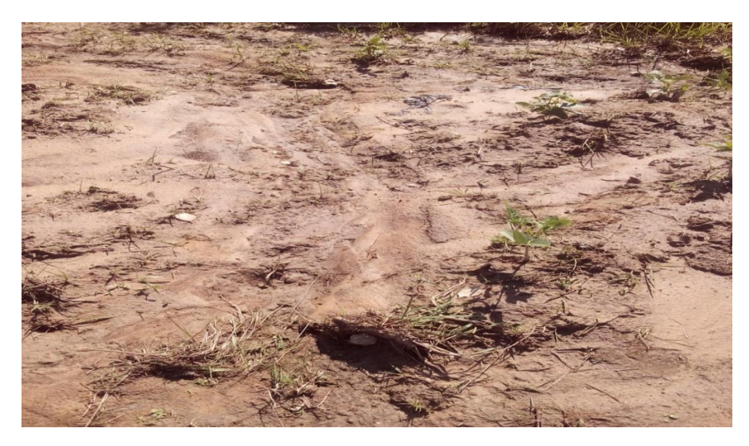
Fig. 2 Rill erosion damaging ridges in cowpea field

The concentration of overland flow, caused by surface irregularities and variations in topography, leads to rills (channels) (Fig. 2). Concentration of runoff in these channels creates an increase in the efficiency and intensity of soil removal. Rill erosion is more dominant on shorter, steeper slopes while interill erosion is more important on longer, gentler inclines. Rills erode downward until they reach the soil layer of low susceptibility to erosion. After that the rills widen by lateral erosion. If the subsoil is also susceptible to erosion, rills eventually transform into gullies.