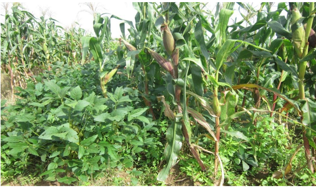
Fig.5 Maize-soybean intercropping system (2 rows maize:2 rows soybean)

intercropping of cereals such as maize (Zea mays), sorghum (Sorghum bicolor ) or millet ( Pennisetum glaucum ) with herbaceous grain legumes or root and tuber crops with other annual crops to improve soil productivity and crop yields. For exampleit was shown that sole groundnut improved the soils' bulk density at the 0 to 10 cm depth (1.26 g cm<sup>-3</sup>) better thansole maize (1.34 g cm<sup>-3</sup>). The cultivation of legumes also resulted in better stability of soil aggregates in the topsoil, which generally reduces the erodibility of the soil. Incorporation of legume in intercrop results in increase soil nitrogen which increases vegetation growth. The studies on intercropping systems indicate that multiple cropping generally contributes to erosion control. The increased coverage of the soil surface and the enhanced stability of soil aggregate reduce the erosivity of the rain and the erodibility of the soil. As the productivity of soils cultivated with different crop species is also increased, this measure is likely to be adopted as a soil conservation technology in the tropics.