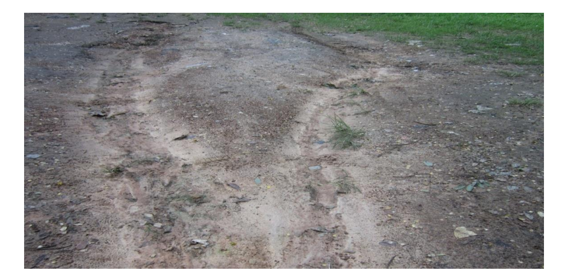
Fig. 3 Early stage of gully erosion

Gullies can develop through multiple mechanisms and are less common than rills, but where locally formed can erode soil at greater rates than rills. Gully dimensions are highly variable, but are typically 0.5–30m deep and again particle size of eroded sediment is non-selective. Soil can also be lost in agro ecosystems through mass movements, in the form of rotational and transitional landslides. Such features are usually localized and tend to be associated with the steepest ground (>20) with relatively little vegetation cover and with significant variations in water table height). Although localized, landslides can result in massive and non-selective soil losses downslope.