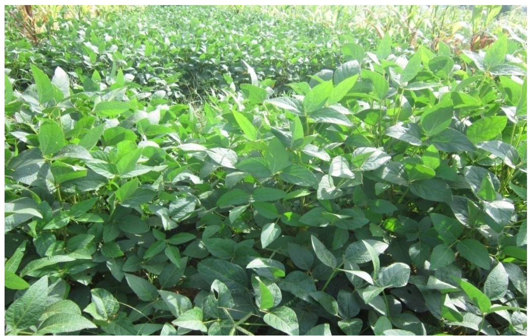
Fig. 4 Soybean field as cover crop

Cover crops also positively influence physical soil properties such as the infiltration rate, moisture content, and bulk density. They increase the organic matter content, nitrogen (N) levels by the use of N_2 -fixing legumes, the cation exchange capacity, and hence crop yields. Another benefit of cover crops is the suppression of weeds, such as speargrass ( Imperata cylindrica ) or witchweed ( Striga hermonthica ) which are common in Nigeria. Farmers benefit from cultivating cover crops as soil loss is reduced and physicochemical soil properties are improved. However, one of the problems of cover crops can be the intensive growth of several cover crop species that might result in competition with food crops for growth factors. This problem can be combated by choosing compatible crops and by controlling the cover crop by timely cutting.